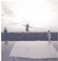
Camp Fontanelle's newest addition; a Jumping Pillow near the corn maze